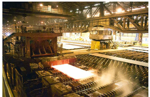
► continued on page 2